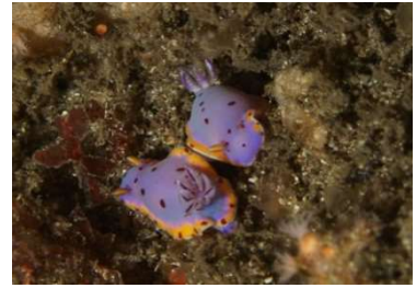
Goniobranchus loringi (D&S) (3 sightings)