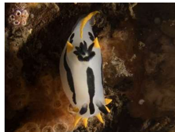
Polycera capensis (T&S&W&K) (3 sightings)