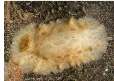
Tayuva lilacina (D&T&K) (2 sightings)