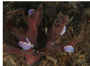
Goniobranchus woodwardi (D&S) (6 sightings)