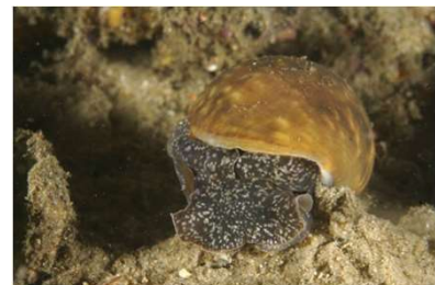
Bulla sp.* (D&S) (2 sightings)