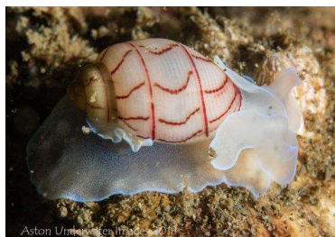
Bullina lineata (D&T&K) (4 sightings)