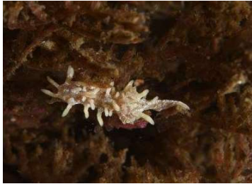
Okenia sp.* (J&K) (2 sightings)