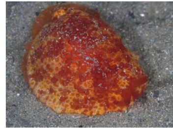
Pleurobranchus peronii (T&S&W&K) (3 sightings)