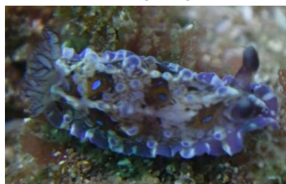
Dendrodoris krusensternii (R&S) (2 sightings)