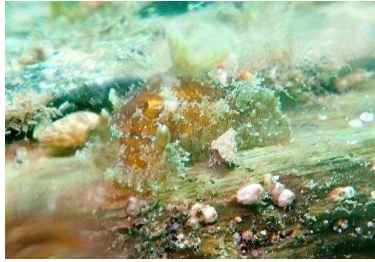
Plocamopherus ceylonicus* (D&T&K) (1 sighting)