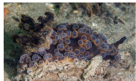
Dendrodoris gunnmatta (T&N) (3 sightings)