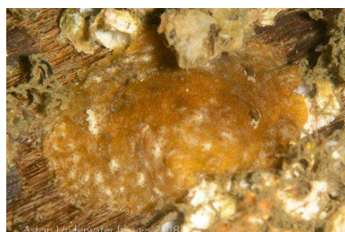
Platydorid sp.* (D&T&K) (1 sighting)