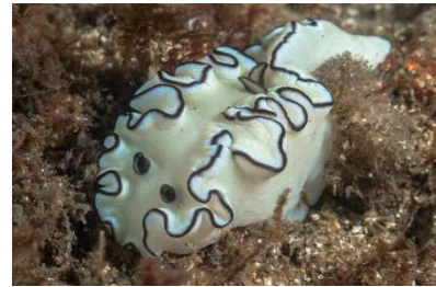
Doriprismatica atromarginata (Z&C) (8 sightings)