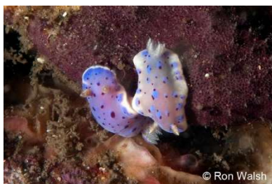
Goniobranchus thompsoni (RW) (5 sightings)