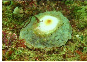
Umbraculum umbraculum (D&T&K) (1 sighting)