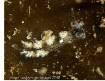
Doto ostenta* (D&T&K) (2 sightings)