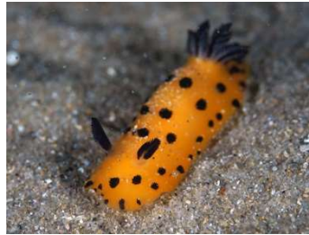
Jorunna sp. 2 (T&S&W&K) (3 sightings)