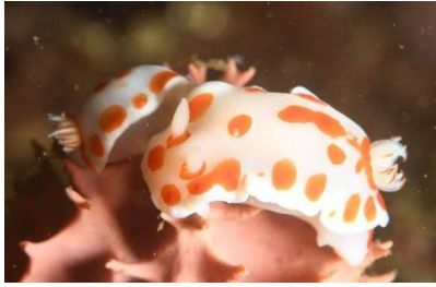
Goniobranchus tasmaniensis (J&K) (1 sighting)