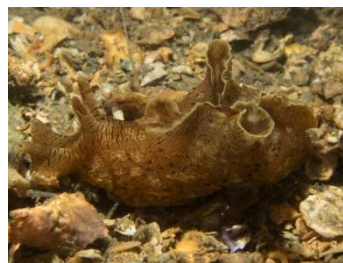
Aplysia sydneyensis (T&S&W&K) (3 sightings)