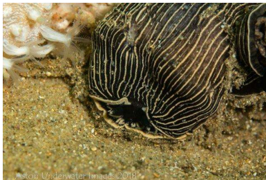
Armina papillata* (D&T&K) (2 sightings)