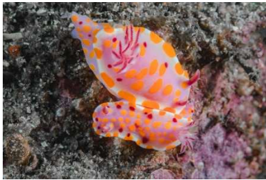
Ceratosoma amoenum (Z&C) (10 sightings)