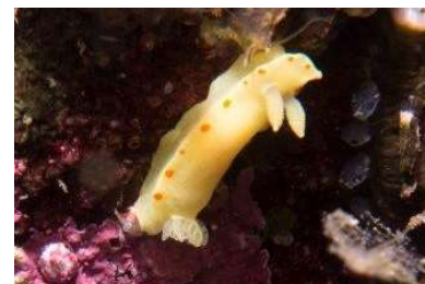
Diversidoris sulphurea (J&J) (2 sightings)