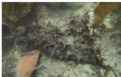
Dolabella auricularia (D&T&K) (1 sighting)