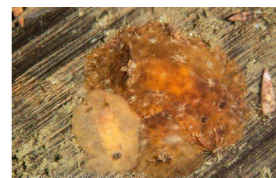
Geitodoris sp.* (D&T&K) (1 sighting)