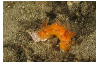
Kaloplocamus ramosus (D&S) (1 sighting)