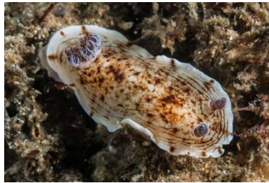
Aphelodoris varia (Z&C) (8 sightings)