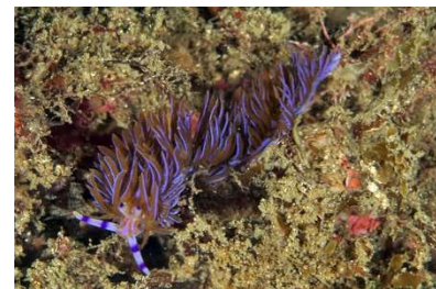
Pteraeolidia ianthina (D&S) (7 sightings)