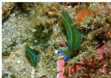
Elysia sp. 1 (J&J) (6 sightings)