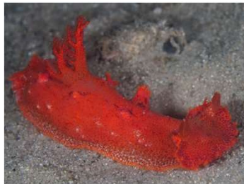
Plocamopherus imperialis (T&S&W&K) (3 sightings)