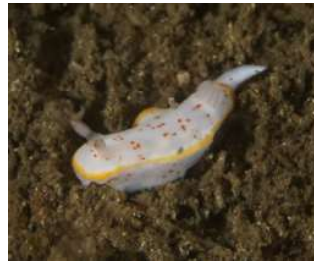
Verconia haliclona (D&S) (1 sighting)