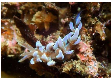
Phyllodesmium macphersonae * (J&J) (1 sighting)