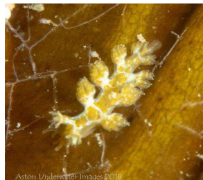
Hancockia burni (D&T&K) (1 sighting)