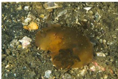
Dendrodoris fumata (D&S) (2 sightings)