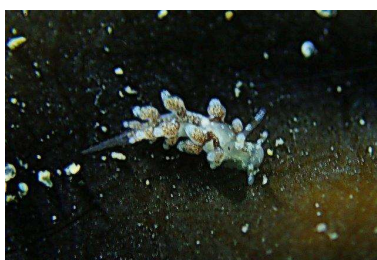
Eubranchus sp.* (D&T&K) (1 sighting)