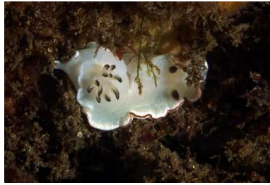
Glossodoris angasi (D&SM) (3 sightings)