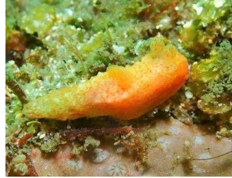
Paliolla cooki (J&J) (2 sightings)