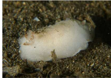
Dorid sp.* (D&S) (1 sighting)