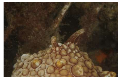
Pleurobranchus hillii * (D&S) (1 sighting)