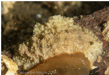
Atagema sp.* (D&T&K) (1 sighting)