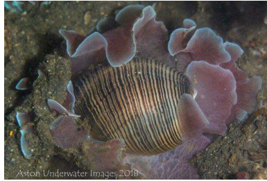
Hydatina physis (D&T&K) (2 sightings)