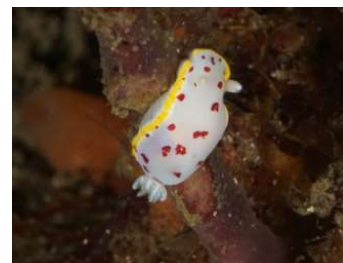
Goniobranchus hunterae (D&S) (4 sightings)