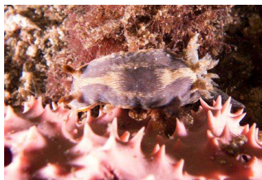
Chromodoris striatella (J&J) (1 sighting)