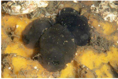
Dendrodoris nigra (D&T&K) (3 sightings)