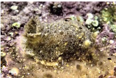
Jorunna pantherina (D&S)# (1 sighting)