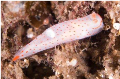
Gymnodoris alba (J&J) (1 sighting)