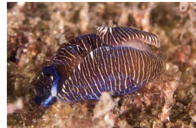
Tubulophilinopsis lineolata * (J&J) (1 sighting)