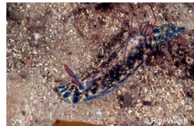
Hypselodoris obscura (RW) (1 sighting)