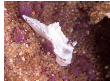
Goniodoris cf. violacea (J&J) (1 sighting)