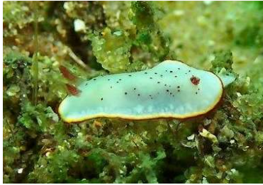
Goniobranchus daphne (J&J) (2 sightings)