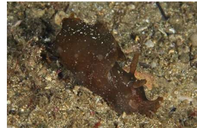
Aplysia juliana (D&S) (2 sightings)