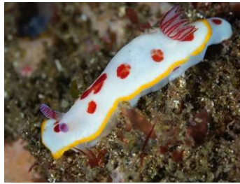
Goniobranchus splendidus (T&S&W&K) (7 sightings)