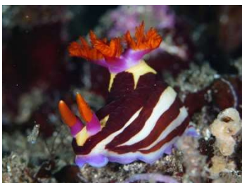
Nembrotha purpureolineata * (T&S&W&K) (1 sighting)