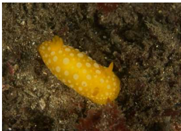
Doris chrysothorax (D&S) (6 sightings)