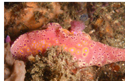
Ceratosoma brevicaudatum (J&K) (1 sighting)