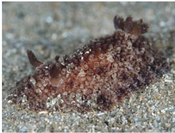
Hoplodoris nodulosa (T&S&W&K) (3 sightings)