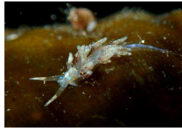
Austraeolis ornata (D&T&K) (1 sighting)