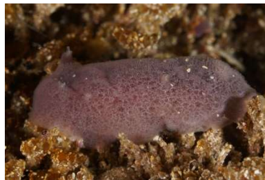
Jorunna ramicola (D&S) (1 sighting)