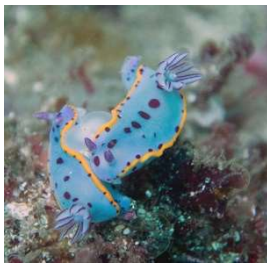
Hypselodoris bennetti (R&S) (8 sightings)