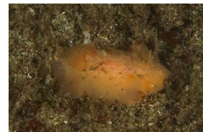
Doriopsilla peculiaris (D&S) (1 sighting)