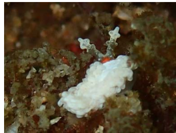
Aeolidiella alba (T&N) (1 sighting)