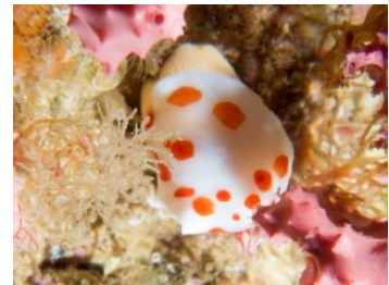
Goniobranchus tasmaniensis (JT) (1 sighting)