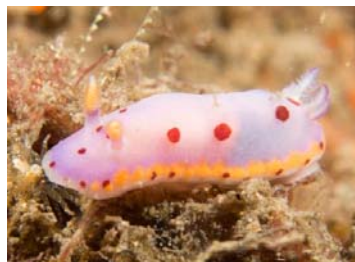
Goniobranchus loringi (JT) (6 sightings)