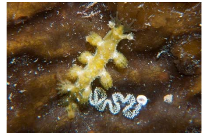
Hancockia burni (S&M) (1 sighting)