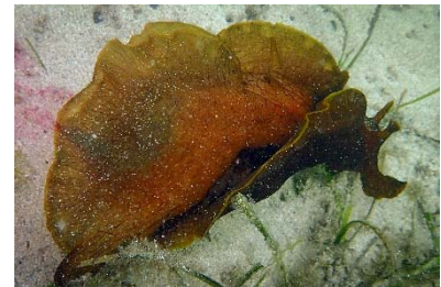
Aplysia sydneyensis (S&M) (1 sighting)