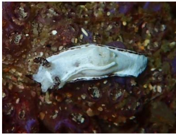
Goniodoris cf. violacea (T&N) (1 sighting)