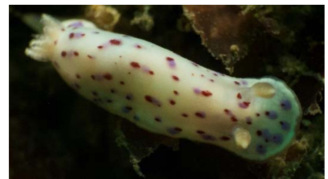
Goniobranchus thompsoni (PKJ) (6 sightings)