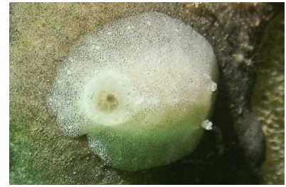
Rostanga australis (I&B) (1 sighting)