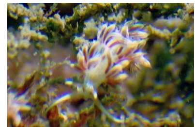
Cratena lineata (KD) (1 sighting)