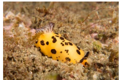
Jorunna sp. 2 (JT) (1 sighting)