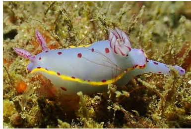
Hypselodoris bennetti (S&M) (9 sightings)