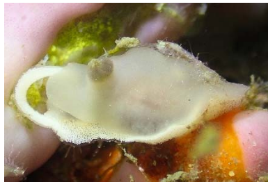
Hallaxa michaeli (S&M) (1 sighting)