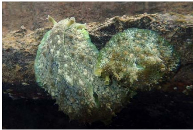
Dolabrifera brazieri (S&M) (1 sighting)