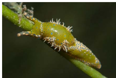
Oxynoe viridis (S&M) (1 sighting)