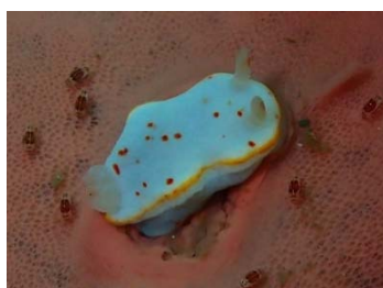
Noumea haliclona (T&N) (4 sighting)