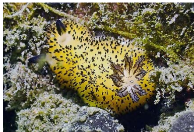
Jorunna sp. 1 (S&M) (1 sighting)