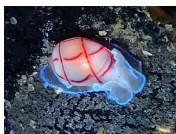
Bullina lineata (T&N) (4 sightings)