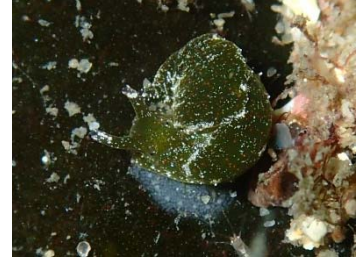
Elysia maoria (T&N) (2 sighting)