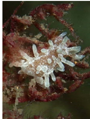
Okenia mija (T&N) (1 sighting)