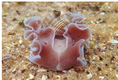
Hydatina physis (S&M) (1 sighting)