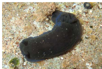
Dendrodoris nigra (S&M) (1 sighting)