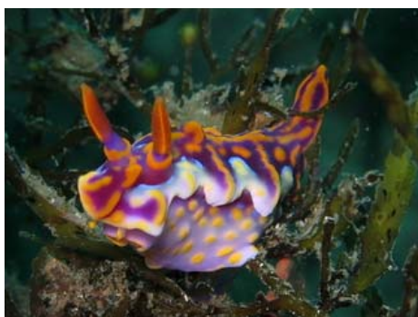
Duncan Heuer's winning image of Miamira magnifica at Kurnell

To help hone those identification skills, and to alert you all to some of the species you may have overlooked in the past, I have selected an image of each species found and provided the number of dive teams that found it (out of a total of 10). The initials of the dive team that took the image are shown in brackets (key at the bottom of this page). (Apologies to Ash and Ian – for some reason your images would only copy across at very low resolution and so I couldn't use them).