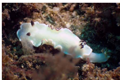
Glossodoris angasi (J&B) (4 sightings)