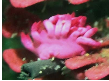
Okenia atkinsonorum (KD) (2 sightings)