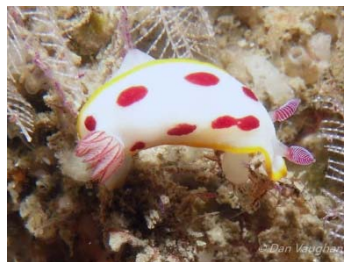
Goniobranchus splendidus (D&K) (7 sightings)