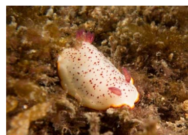
Goniobranchus daphne (JT) (4 sightings)