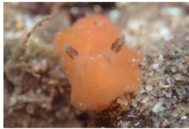
Rostanga arbutus (S&M) (1 sighting)