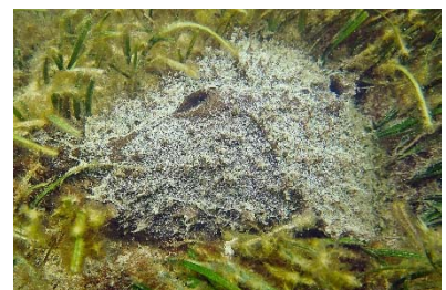
Dolabella auricularia (S&M) (1 sighting)