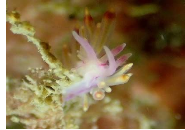
Flabellina rubrolineata (KD) (1 sighting)