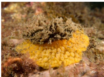
Umbraculum umbraculum (JT) (1 sighting)