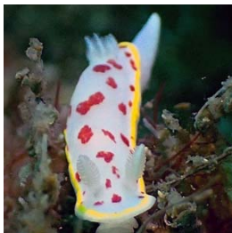
Goniobranchus hunterae (KD) (6 sightings)