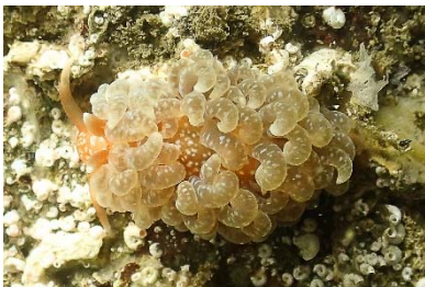
Spurilla braziliana (S&M) (1 sighting)