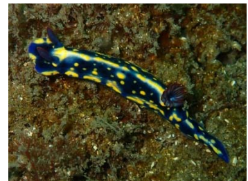
Hypselodoris obscura (T&N) (1 sighting)