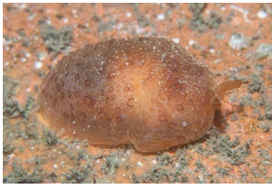
Pleurobranchus peronii (S&M) (1 sighting)