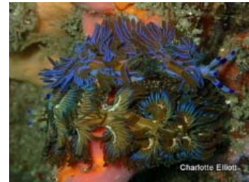
Pteraeolidia iantheta (D&C) (9 sightings)