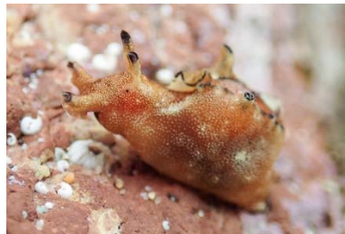
Aplysia parvula (S&M) (1 sighting)