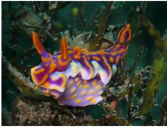
Miamira magnifica (D&C) (2 sightings)