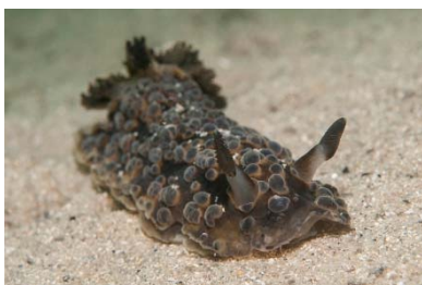
Dendrodoris gunnamatta (S&M) (1 sighting)