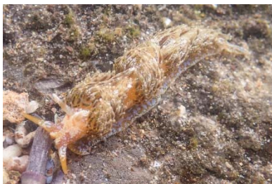
Australolis ornata (S&M) (1 sighting)