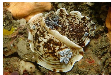
Aphelodoris varia (L&M) (6 sightings)