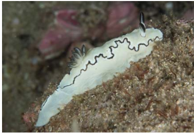
Dorisprismatica atromarginata (A&I) (10 sightings)