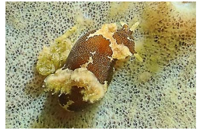
Trapania brunnea (J&Y) (1 sighting)