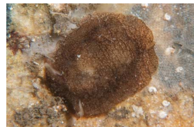
Pleurobranchaea maculata (S&M) (1 sighting)