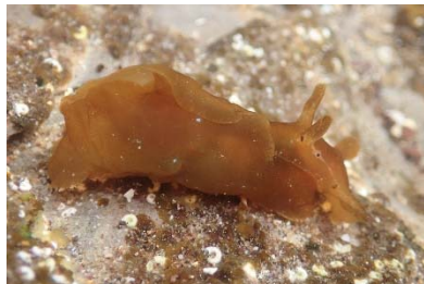
Aplysia juliana (S&M) (1 sighting)