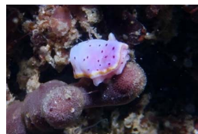
Goniobranchus woodwardae (D&K) (3 sightings)