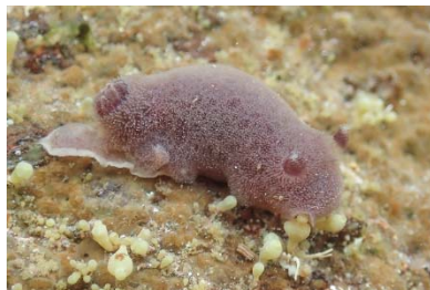
Jorunna hartleyi (S&M) (1 sighting)