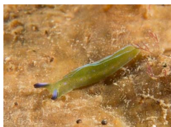
Elysia sp. 1 (JT) (3 sightings)