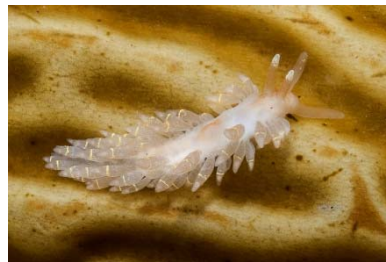
Spurilla macleayi (S&M) (1 sighting)