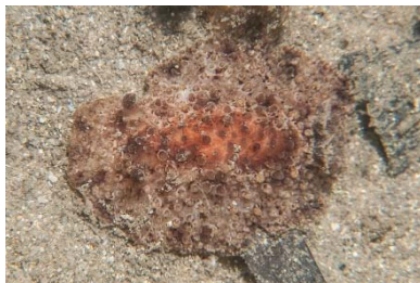
Hoplodoris nodulosa (S&M) (1 sighting)