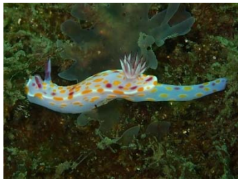
Ceratosoma amoenum (T&N) (9 sightings)