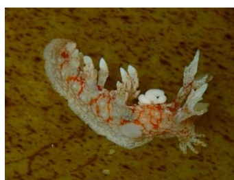
Bornella hermanni (T&N) (1 sighting)