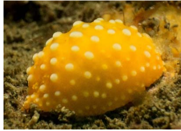
Doris chryso-derma (D&C) (2 sightings)