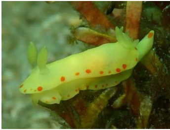
Diversidoris sulphurea (T&N) (2 sightings)